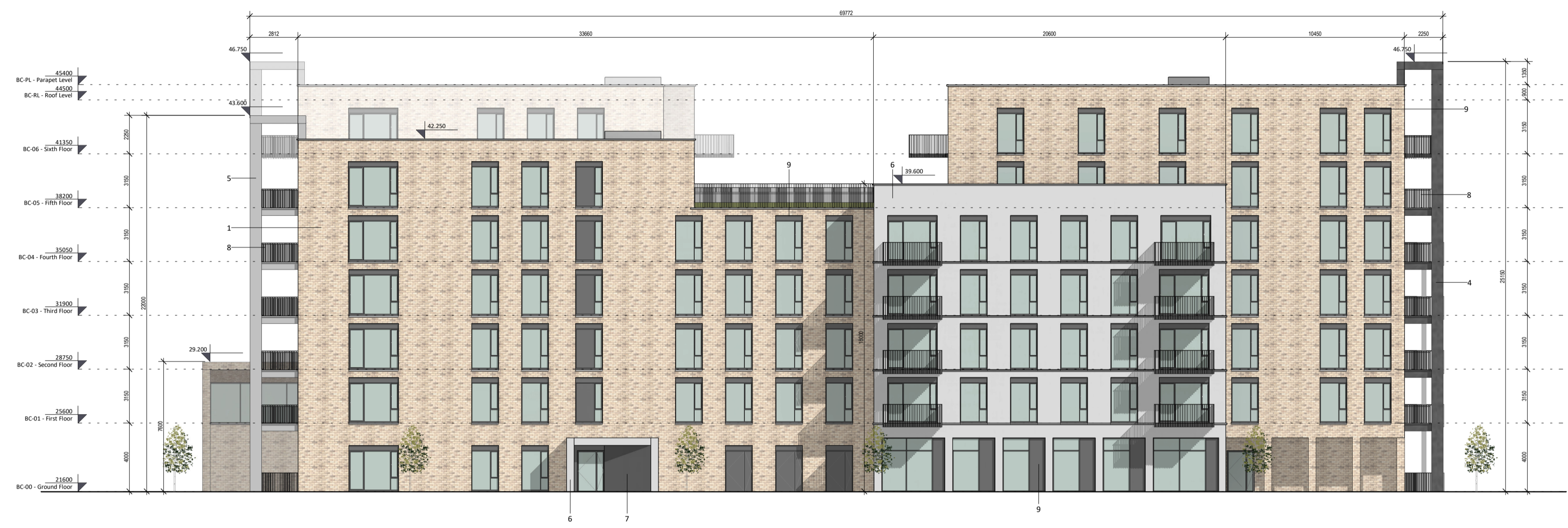
1 BC-North Elevation 1:200