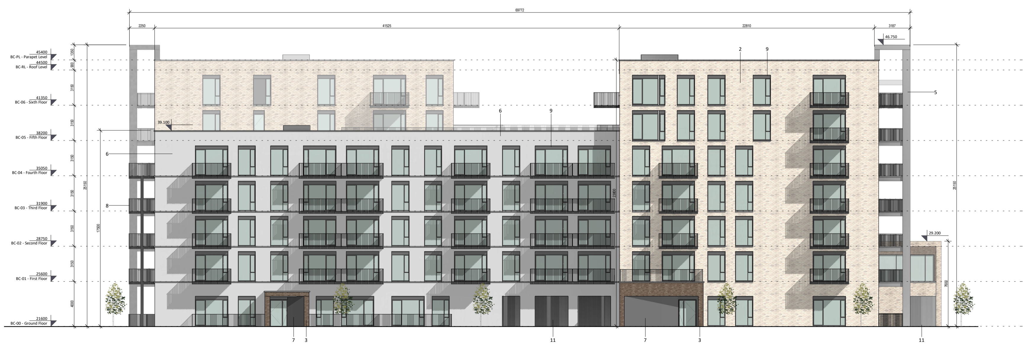
2 BC-South Elevation 1:200

All levels (in meters) are related to Malin head datum. All dimensions in millimeters. Figured dimensions only are to be taken from this drawing.